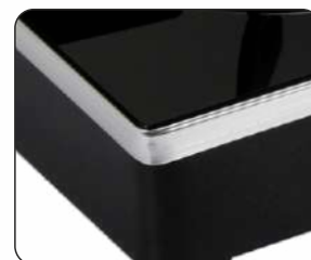
Aluminum Border Glass