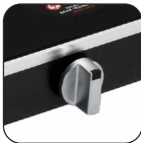
Elegant Metal Knobs With In-built Auto Ignition