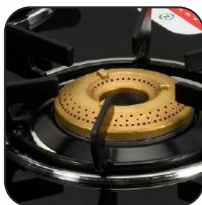
6 Pronges Designer Pan Support for Better Stability for pen