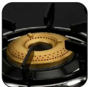
Forged Brass Burners for Long Life