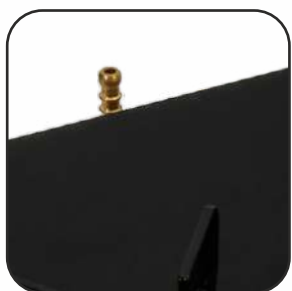
Revolving Brass Gas Pipe Nozzle