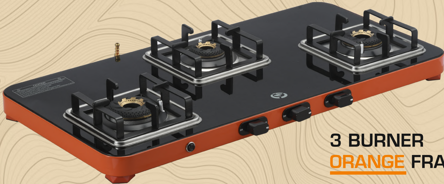
3 BURNER ORANGE FRAME