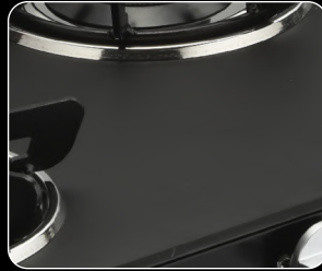
Toughened Frost Glass Top