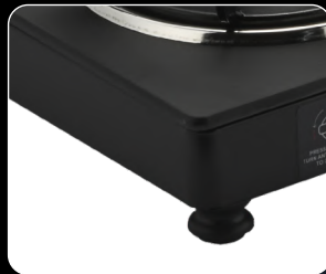
Premium Look Sleek Frame