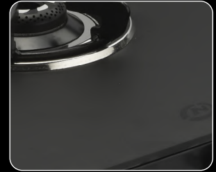
5 Years Guarantee on Glass