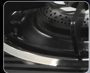
6 Pronges Designer Pan Support for Better Stability for Pan