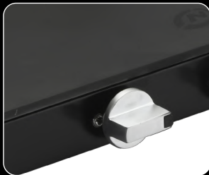
Exclusive Metal Knobs