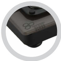
Sleek Steel Frame with Best in Class Space between Burners