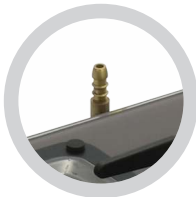
360° Moveable Brass Gas Pipe Nozzle