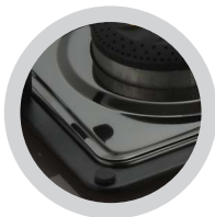
Black Mirror Double Drip Trays