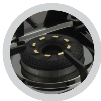
Forging Brass Burners