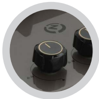
Designer Metal Knob