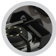
Flame Guard Designer Pan Supports