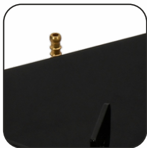
Revolving Brass Gas Pipe Nozzle