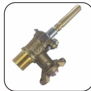
5 Click Full Brass Valve