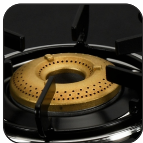
Forged Brass Burners for Long Life