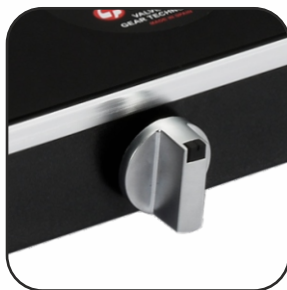
Elegant Metal Knobs With In-built Auto Ignition