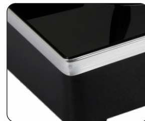
Aluminum Border Glass