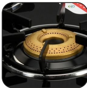
6 Pronges Designer Pan Support for Better Stability for pen